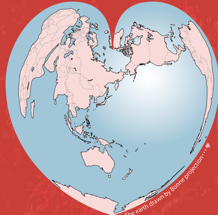
The earth drawn by Borne projection